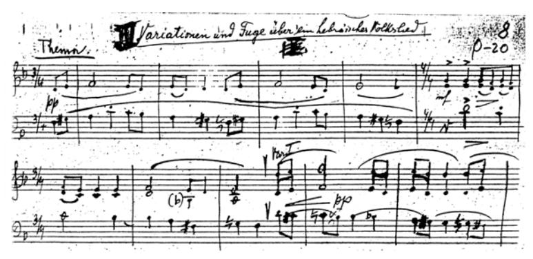
Theme of the variations (from the manuscript of the 7th Piano Sonata)

See, her blood flows in my blood, her voice sings in mine, Rachel, who tends the <u>herds of Laban</u>, Rachel, mother of mothers.