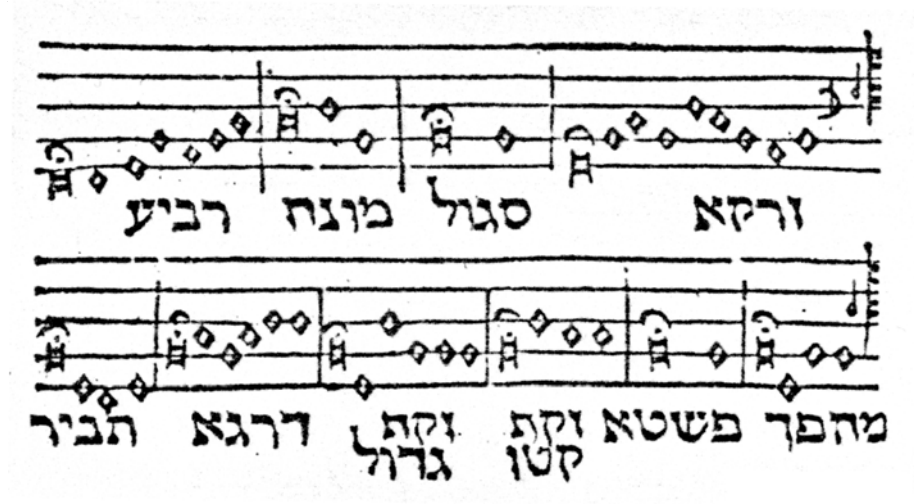
Motifs from the Bible cantillations in Reuchlin's De accentibus et orthographia linguae Hebraicae