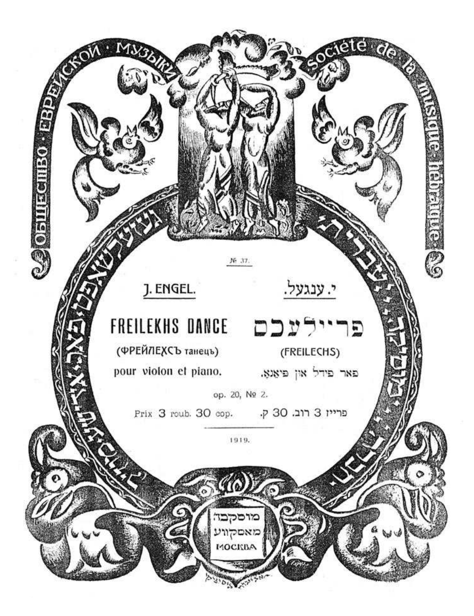
El Lissitzky, cover page of the sheet music editions of the Moscow department of the Society for Jewish Folk Music (1918–1919)