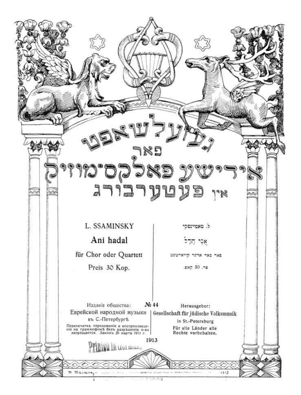
Moisei Maimon, cover page of the third series of publications by the Society for Jewish Folk Music in St. Petersburg (1913–1914)