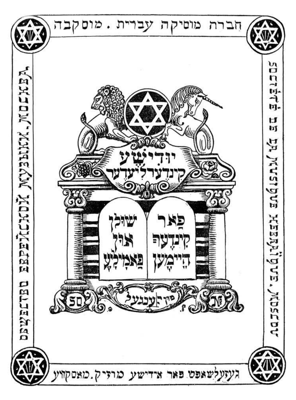
Leonid Pasternak, cover page of the sheet music editions of the Moscow department of the Society for Jewish Folk Music